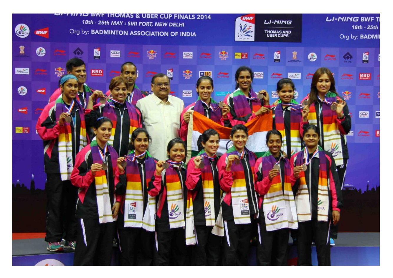
(Uber Cup Finals 2014 Bronze Medalist Indian Women Team)